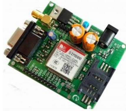
Fig 5. GSM Module

SIM COM GSM modem sends the received latitude and longitude via SMS. GSM stands for Global System for Mobile Communication. A GSM module is a chip or circuit that will be used to establish communication between a mobile device or a computing machine and a GSM or GPRS system. module. Fig 5. shows a GSM module.