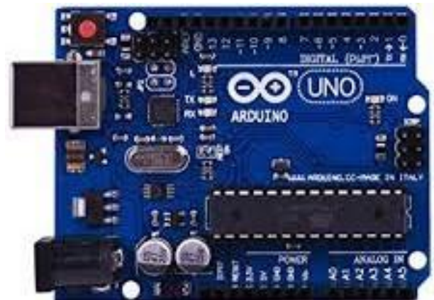
Fig 6. Arduino microcontroller

Arduino UNO is used in this system. Arduino UNO is a microcontroller board based on the ATmega328P (datasheet). It has 14 digital input/output pins of which 6 can be used as PWM outputs, 6 analog inputs, a 16 MHz quartz crystal, a USB connection and a reset button. Low power microcontroller is used for this system and Arduino suits this application. Fig.6. shows the Arduino board.