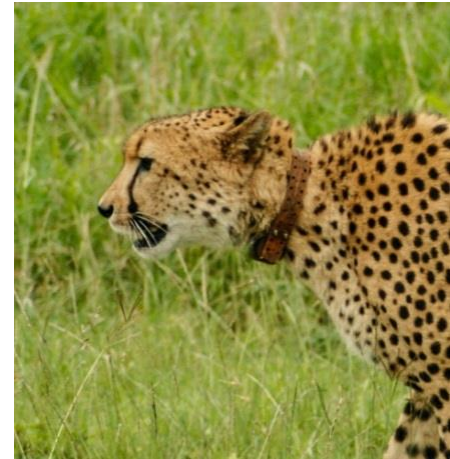
Fig 1.A cheetah with tracking collar

Hence in order to track the location Global Positioning System receiver and Global System for Mobile communication is used. In this project a GPS modem helps to get the coordinates of the location. This modem requires minimum 4 satellites Global Positioning System modem receives location parameters like latitude and longitude from the satellite. We have also used GSM modem which sense these parameters to particular mobile number through SMS. This information is used to locate the current location using Google map. We have added a temperature sensor to this project. If the animal has fever or if there are some wounds on animal body and because of wounds temperature of animal rises, then it sends SMS to the forest officer so he can give immediate attention.