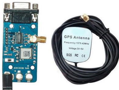
Fig 4. GPS modem

A GPS receiver's job to locate four or more of these satellites, figure out the distance to each, and use this information to deduce its own location.