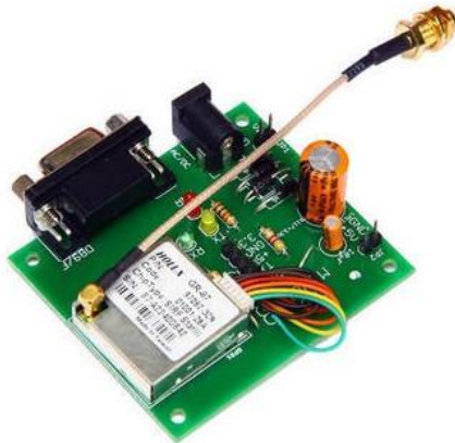
Fig 3. GPS module

A satellite navigation device can retrieve the location and time information in all weather conditions, anywhere on or near the Earth. GPS devices need to be connected to a computer in order to work. This computer can be a home computer, laptop, PDA or smartphones. Fig. 3 and 4 shows a GPS modem.