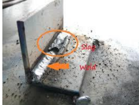
FIG 1. ARC WELDING SLAG

Manual metal arc welding (MMAW) or shielded metal arc welding (SMAW) that uses a consumable electrode covered with a flux to lay the weld. The arc is struck between a flux covered stick electrode and the work-pieces. The work-pieces are made an important part of an electric circuit, known as welding circuit. The work piece and the electrode melts forming a pool of molten metal that cools to form a joint.