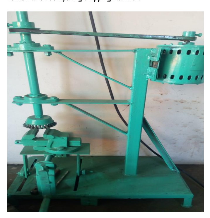
FIG 4 WELDING SLAG REMOVAL MACHINE

The linkage mechanism replaces the servo DC motors with encoder and de-coder arrangement used in the automatic machines to carry out the same indexing activity. This makes a considerable saving in budget for machine. A wire brush will work on surfaces that aren't flat and can be best when you have to clean areas of intricate metal work. This is because a wire brush can be forced into nooks and crannies that a needle gun wouldn't be able reach. The size of the wheel also makes it more flexible for small areas. Depending on what you're stripping, a wire brush can be an excellent complement to a needle gun. A wire brush works fairly quick. This machine requires less space, hence most suitable for small industries. It is semi-automatic machine giving more accurate results. It requires less skilled persons and provides more safety to human when comparing chipping hammer.