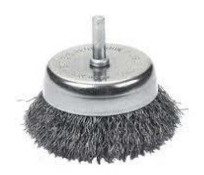
FIG 3 WIRE BRUSH

A wire brush attaches to your drill. The bristles are made of stiff wire and as the drill spins, these bristles clean rust and paint off of metallic objects. A wire brush works moderately quickly, a wire brush will work on surfaces that aren't flat (unpleasant) and can be best when you have to clean areas of intricate metal work. This is because a wire brush can be forced into nooks and crannies that a needle gun wouldn't be able reach. The size of the wheel also makes it more flexible for small areas. Depending on what you're stripping, a wire brush can be an excellent complement to a needle gun. The chipping hammer is great for general purpose welding when combined with a wire brush, results are generally good. Hence there is need of a special purpose machine to remove slag from welded components.