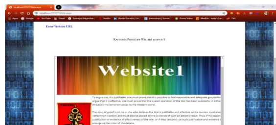
Figure 3. Final score