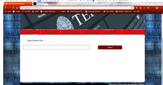
Figure 2. URL page

The below images show the complete result.