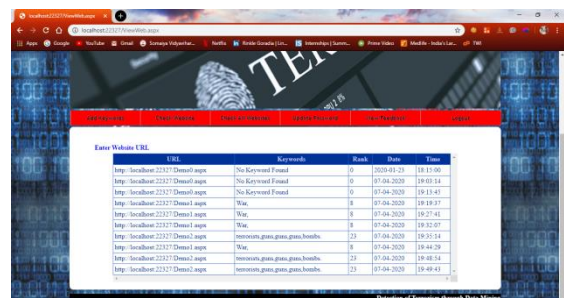
Figure 4. History of visited websites