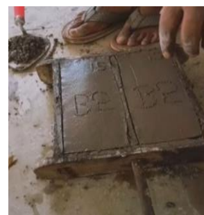
Fig. IV Placing the mix.