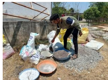
Fig. I Taking raw material

The standard consistency or normal consistency of a cement is based on the depth to which the Vi-cat plunger must penetrate, which is typically 5-7 mm from the bottom of the Vi-cat mould, and how much water is required (measured as a percentage of the dry cement's weight) to create a uniformly consistent cement paste.