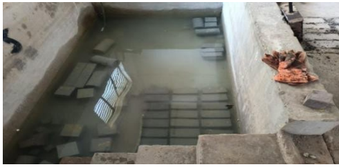
Fig. V Curing process