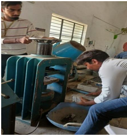
Fig. VI Compression test on bricks