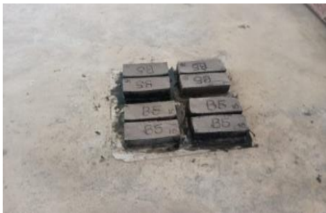
Fig. VII After drying of bricks