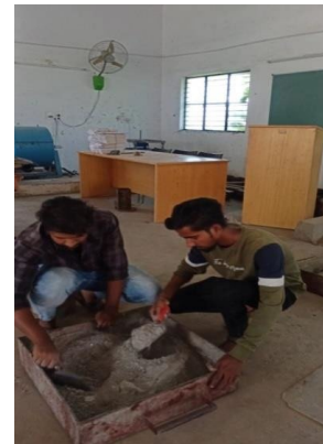
Fig. III Mixing process