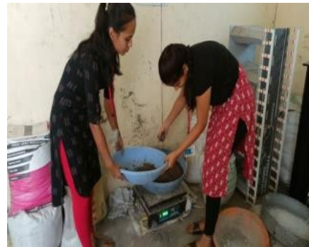
Fig. II Weighing of materials