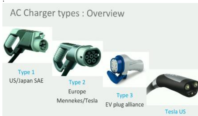
Figure 2 AC Charger types

Generally, an AC connector has two or more larger pins to transmit power and a few smaller pins for the sake of communication. There are four types of AC connectors (fig 2) used globally.