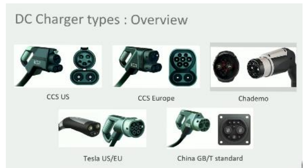
Figure 4 DC Charger types