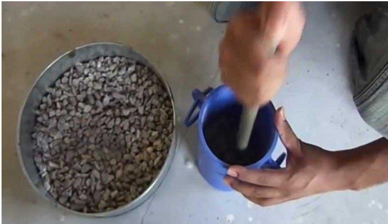
1.6 Aggregate crushing strength test