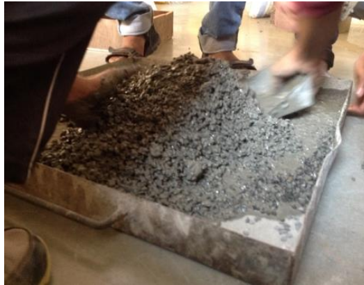
1.3 Wet mix of concrete.