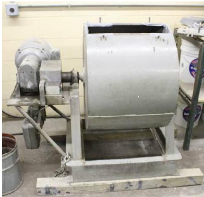
1.7 Los Angeles Abrasion Test