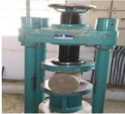
2.1 Split tensile strength test