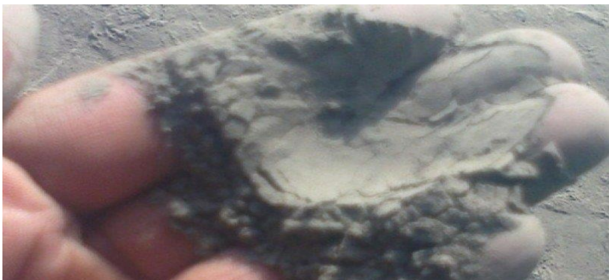
1.4 quality of cement