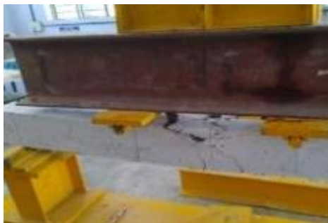
2.2 Flexural strength of beam