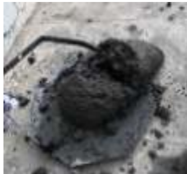
2.0 Collapsed slump