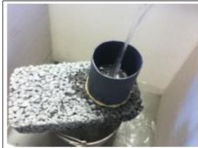
2.4 Pouring water through the pipe a

The infiltration rates of the 10mm samples were acceptable, with fast rates ranging from 17.37-26.86 mm/s. The infiltration rates of the 4.75mm samples were not so fast, with rates ranging from 3-8.55 mm/s. It is possible that the two samples with the same porosity had different infiltration rates because of differences in connectivity of the voids within the internal structure of the samples. The high degree of variability in infiltration exists because the void connectivity variability is not accounted for by porosity. infiltration rate vs porosity for sample of 10mm and 4.75mm aggregate.