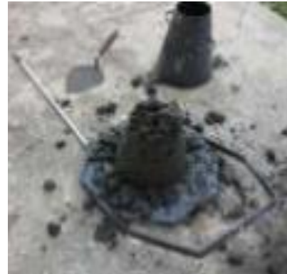
1.9 Shear slump