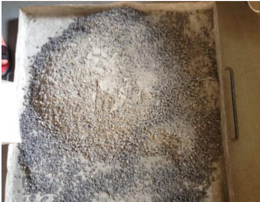
1.2 Dry mix of concrete.