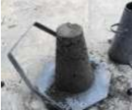
1.8 True slump

Slump test is the most usual method of measuring concrete consistency that can be used either in the laboratory or in the workplace. Slump is a measure that indicates cement concrete's consistency or workability. Bottom diameter= 200 mm, top diameter= 100 mm and height= 300 mm, however, it is conveniently used as a control test. The slump cone test value was found to be 78 mm for 0.43 water cement ratio. For this investigation, therefore, this ratio is used.