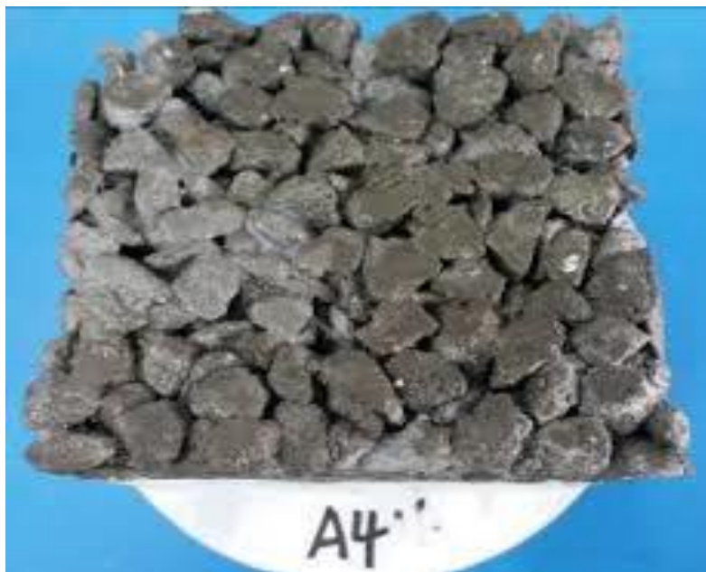
2.3 Materials Proportions in Pervious Concrete