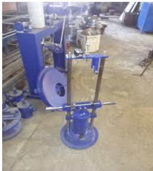
1.5 Impact test