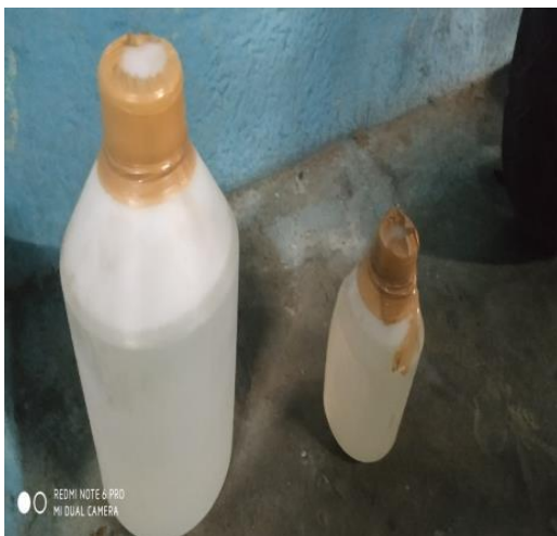
Fig.4 Epoxy resin