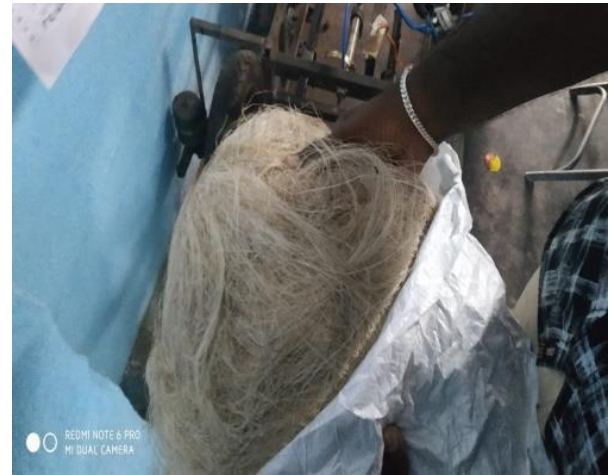
Fig.1 sisal fiber

a central decortication plant, where water is used to wash away the waste parts of the leaf. Sisal fiber is fully biodegradable, green composites were fabricated with soy protein resin modified with gelatin. Sisal fiber, modified soy protein resins, and composites were characterized for their mechanical and thermal properties. We used long fiber to analysis the materials. Sisal fiber cut to the length of 80mm. shown in fig1