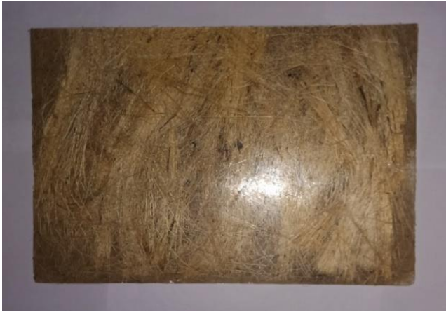
Fig 5 Fabricated specimens

The epoxy-polysulfide blend was reinforced by cutting and weighting the fibers; using a volumetric fraction of 20% and the rules of mixtures, the weight ratio of the fibers could thus be determined from the total weight of the blend. The method used was to pour an amount of the blend into the mould before adding the first layer of fiber, then adding another amount of the blend, continuing this process to develop a composite material reinforced with three layers of fiber. The samples created in this way. The composite materials were left at room temperature for 24 hours before being extracted from the moulds and placed in the drying oven at 60 °C for 8 hours to complete the process of solidification and to eliminate any stresses that may have formed during the process of reinforcement. Finally, the samples were cut according to the standard specifications for each test.