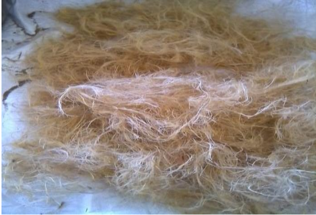
Fig.2 borassus fiber

been one of the most important trees of Cambodia and India, where it is useful over 800 different ways. The fruits are eaten either roasted or raw, and the young, jellylike seeds are also edible Borassus fine fiber tensile properties and chemical composition. In addition, the morphology and structural, crystallinity and thermal degradation of Borassus fibers were also investigated. To investigated the material at the range of fiber length in 80mm at dry condition. Shown on fig.3