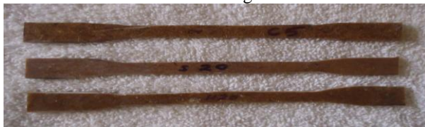
Figure 1: Tensile Test Specimen Before Test

The natural fibers are thoroughly washed with distilled water in order to remove dirt, sediments and other contaminations like light and soft fiber. Then the fiber is dried to remove the moisture until it gains constant weight then Alkali treatment has been done to improve the dispersion of the particles, reducing agglomeration by reducing the hydrogen bonding that holds them together. The UP resin and hardeners are mixed in the ratio, (MEKP) catalyst 1.5 gm & (1% Cobalt) accelerator 3.0 gm, as recommended by the resin manufacturer. The dried & chopped fibers are then added in to the UP resin as per the required ratio and well blended until the constituent mixes uniformly. Then the mixture is transferred into the mould and allowed to remain in the mould for 24hrs under load of 100kg. The molded composite is removed from the mould after 24hrs. Then the composite material is cured in the furnace at 100°C for 2hrs. This eliminates moisture from the material. Specimens of suitable dimension as per ASTM-D638 standard are cut using a diamond cutter for tensile testing.