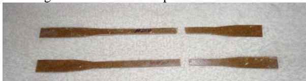
Figure 2: Tensile Test Specimen After Test