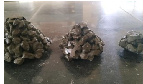
Fig 2. Casted No fines concrete nails of three different dimensions