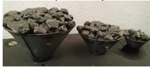
Fig 1. Casting of No fines concrete of three different dimensions

Figure 1 and figure 2 shows the casting and casted no fines concrete nails for the experimental study.