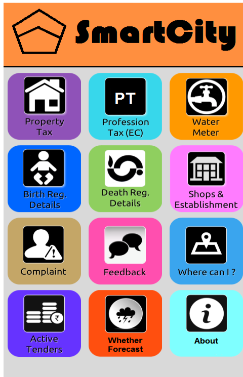
Fig 3: GUI of Smart City

Above figure shows basic or first look of GUI of the Application. It consists of various services offered by the application. It also consist of language switch key to change language of the User Interface according to user convenience.. Language switch will offer languages like Hindi, English, Marathi, etc.