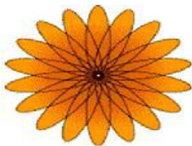
Fig 1. Switched Beam System Coverage Patterns (Sectors)

Switched beam antenna systems form multiple fixed beams with heightened sensitivity in particular directions. These antenna systems detect signal strength, choose from one of several predetermined, fixed beams, and switch from one beam to another as the mobile moves throughout the sector. Instead of shaping the directional antenna pattern with the metallic properties and physical design of a single element (like a sectorized antenna), switched beam systems combine the outputs of multiple antennas in such a way as to form finely sectorized (directional) beams with more spatial selectivity than can be achieved with conventional, single-element approaches. Switched Beam System Coverage Patterns (Sectors).