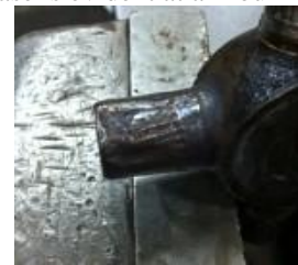
Figure 5 Burned U-Joint Trunnion

Improper lube procedures, where recommended purging is not accomplished, can cause one or more bearings to be starved for grease. Always make sure new, fresh grease is evident at all four Yoke joint seals.