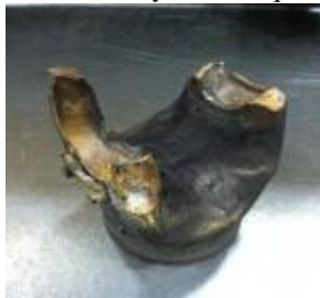
Figure 7 Weld Yoke Failure (5)

Bent yokes will put abnormal loading on the U-joint bearings and lead to premature failure. A yoke can be bent by a Torsion load or by over torque the yoke.