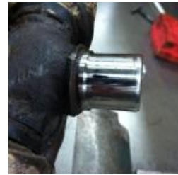
Figure 3 Universal Joint Brinelling

Brinelling is when needle marks appear on the surface of the U-joint cross, which is usually caused by excessive torque, driveline angle. It can also be caused by a seized slip yoke or by a sprung or bent yoke.