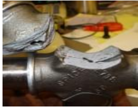
Figure 6 Universal Joint High Torque Fracture