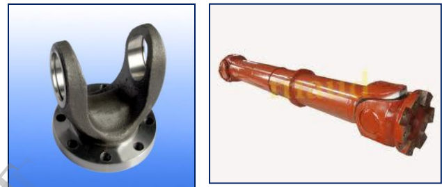
Figure1. Typical Yoke-joint Assembly. (1)

The universal joint consists of two forged-steel yokes or forks joined to the two shafts being coupled and situated at right angles to each other. A spider hinges these two yokes together. Since the arms of the spider are at right angles, there will be four extreme positions during each revolution when the entire angular movement is being taken by only one half of the joint. This means that the spider arm rocks backwards and forwards between these extremes and the output-shaft speed will therefore increase or decrease twice in one revolution.