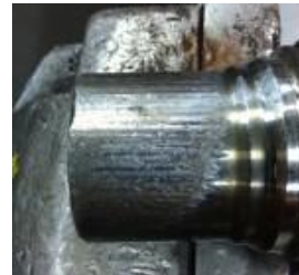
Figure 4 Universal Joint Spalling

Spalling looks like the bearing surface of the U-joint has been "scraped" away. Spalling is usually caused by water or dirt contamination.