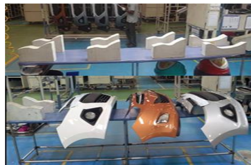
Fig 8: Packing of Bumpers

In the buffing process of polishing the parts and the removing the unwanted foreign particles which makes the parts as a dusted surface. Then the time taken to complete a single part is more because of the size of the backup pad is very small. So the size of the backup pad is increased to reduce the time consumption and avoid the foreign particles. This counter measures is provided to manage the time.