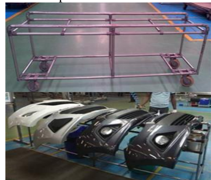
Fig 5: Packing of Bumpers

The buffing is the process of removing the unwanted particles like dust which is present on the surface of the paint. It consists of the backup pad which where the cleaning cloth is attached to it. The normal size of the backup pad we are using in the line is 60mm by this only the small area of the part is covered and the time is increased to finish the process.