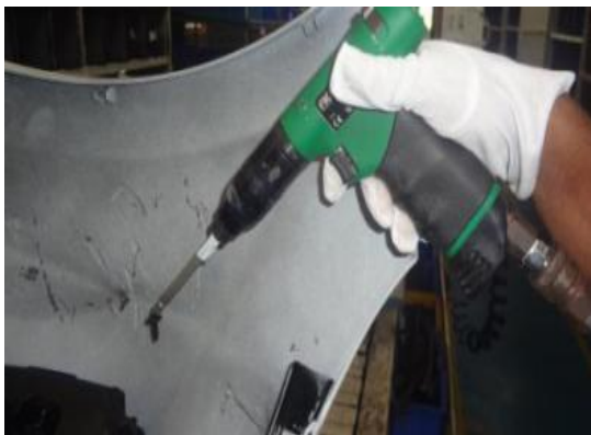
Fig 3: Material Handling

Due to the continuous process in the screw bit the Magnet losses its magnetic strength and there is a possibility of the fall down of the screw and causes some time consumption and concentration of the worker is distraction on the falling screw so there is a possibility of making scratches in the bumpers and some other parts which is handled in the assembly lines. This material handling takes