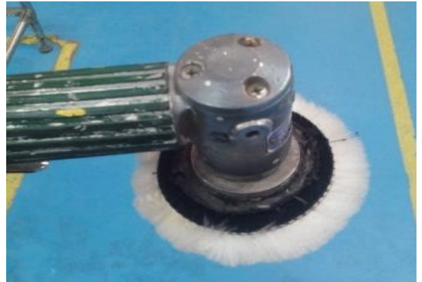
Fig 4: Buffering Brush

place the vital role in the economic status of the company by increasing the work load in the check line and decreasing the production of the car which is again sent to the paint department for making the touch up in the scratches.