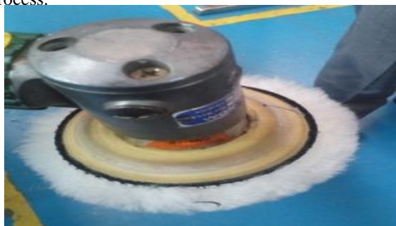
Fig 7: Buffing Brush

Like above mentioned in the possible causes due to the continuous action of the screw bit the magnetic strength of the screw bit is decreased so the only way to make correction in the material handling is we should increase the magnetic strength of the screw bit which has the capable of holding the screw in proper manner. By using the more magnetized screw bit the screw could not fall down easily and the worker takes only less time to make the process.