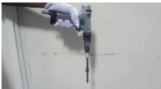
Fig 6: Material Handling

Like above mentioned in the possible causes due to the continuous action of the screw bit the magnetic strength of the screw bit is decreased so the only way to make correction in the material handling is we should increase the magnetic strength of the screw bit which has the capable of holding the screw in proper manner. By using the more magnetized screw bit the screw could not fall down easily and the worker takes only less time to make the process.