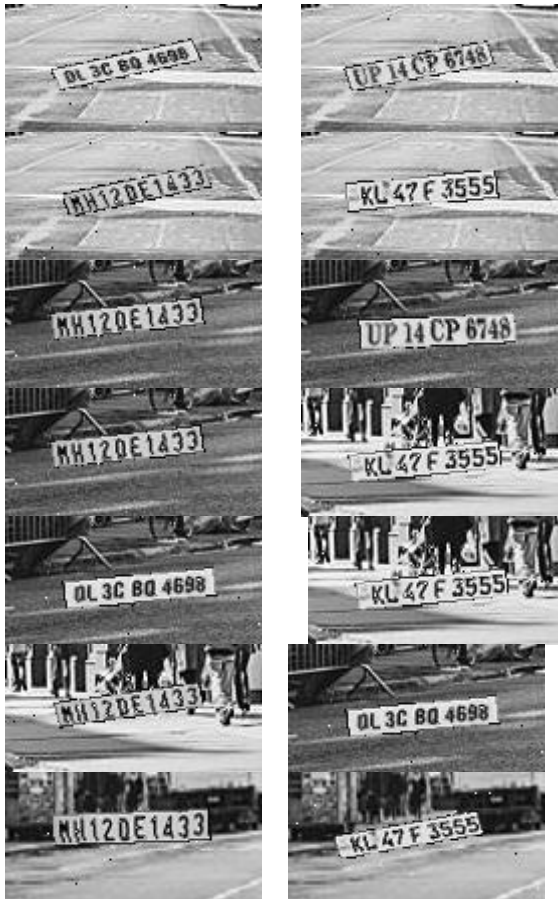
Fig2:- Database of different images

Database-: Create Our Own Database Of 16 different Images Which Can Be Stored In Memory To Identify The Different Number Plates.