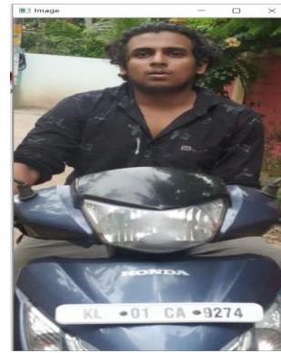
Fig. 3 : Rider not wearing helmet

Figure 3 shows the rider not wearing helmet. Since the rider is not wearing helmet the bottom half of the image will be saved for the next step which is the license plate extraction.