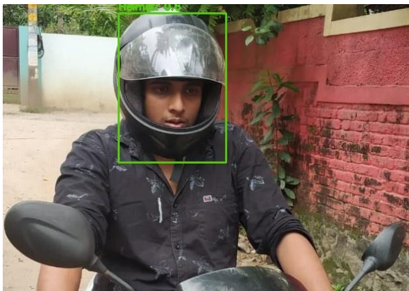
Fig. 2: Detection of rider wearing helmet

Figure 2 shows the detection of the rider wearing helmet.