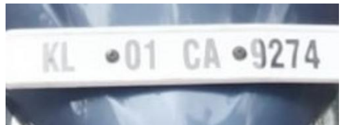
Fig. 4 : License plate of non-helmet wearing rider

Figure 4 shows the detection of the license plate.