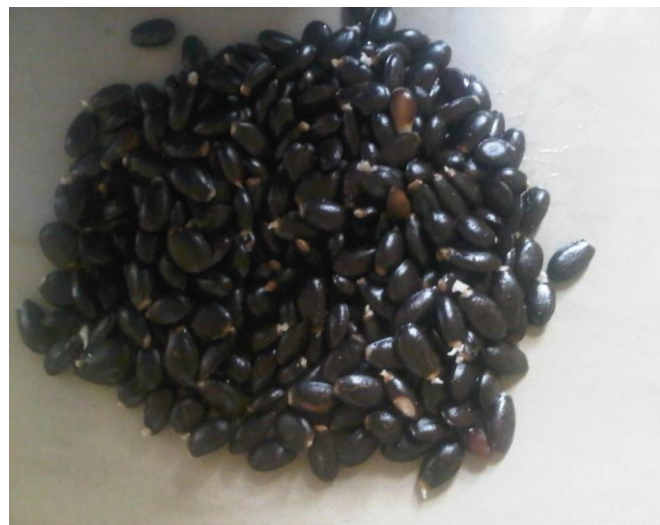
Figure 3. Washed Soursop seeds.