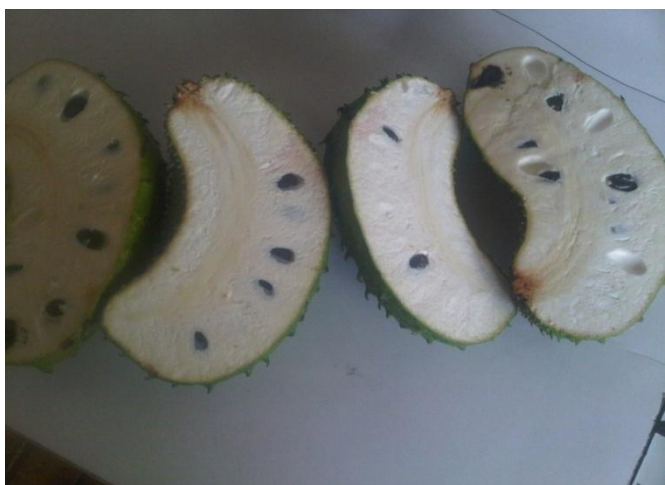
Figure 2. Sliced Soursop fruits, showing the flesh and the inter-spaced seeds.