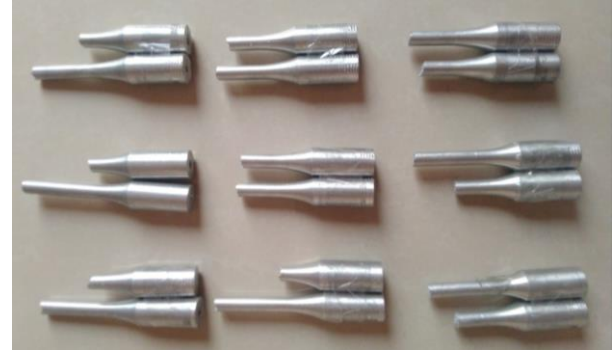
Fig 2 Tensile strength HMMC samples

Fig. no 2 indicates the tensile evaluation samples that are machined from fabricated rods. The examples happen to be fabricated according to Taguchi orthogonal range as well as the tensile and hardness seemed to be examined. The hardness was tested at three different locations and the common value is taken to the analysis. The tensile check desired specimens had been well prepared and machined from your casting. The tensile tests were completed with the specimen within the universal testing machine at room temperature.