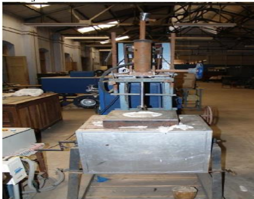
Fig 1. Stir casting machine set up

A pre-specified amount of Al6061 is melted in crucible furnace. The melting temperature of Al alloy was 700, 750 and 800 °C. The SiC and Gr reinforcement particles having 15 micron size are pre-heated upto 500°C temperature to remove the impurities. The pre-heated reinforcement is added to molten metal and stirrer. The stirrer is carried out on 500, 600 and 700 RPM for 5, 7 and 9 min. The slurry is then transmitted to die through pathway pre-heater, which was set for 300°C. The pathway also maintains some temperature so that the mixture will not solidifies. This slurry is poured into a preheated die cavity, located on the bed of a hydraulic press through pathway. The press is activated to close off the die cavity and to pressurize the liquid metal. Finally the component is ejected after solidification