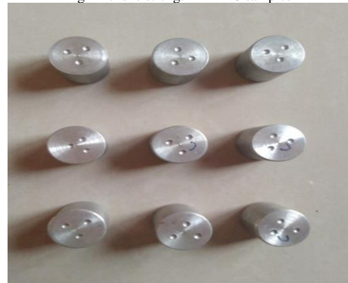
Fig 3 Hardness HMMC samples