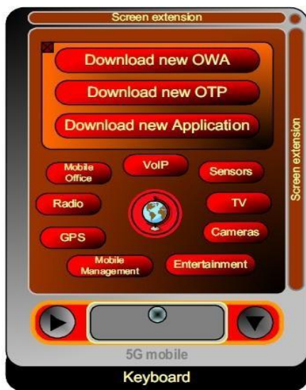
FIG.1. 5G Mobile Phone Concept