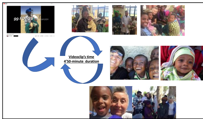
Fig. 1. Clips of videoclip of the studied song demonstrated on Youtube [11].

On 11 December 2020, videoclip was entitled '99 photographs and one song' and uploaded on Youtube [11] to aim at encouraging users to know the work developed by the NGDO, called MOS Solidaria [9]. Videoclip had a 4'50-minute duration with photographs obtained from M. Ascensión Olcina Simón and Foundation Emalaikat [12]. Furthermore all rights were ceded to the solidarity cause of this NGDO. Several clips of this videoclip are shown in Figure 1.