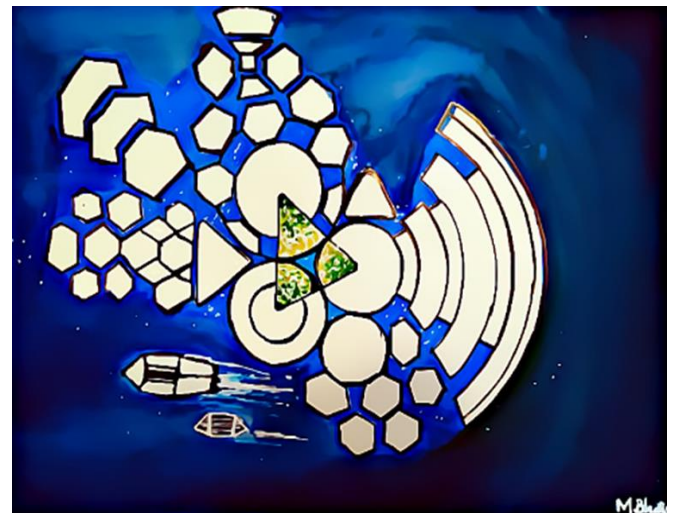
Fig.1. Aerial view of Sustainable floating City

confronting water at a higher chance of surges. Both expanding urbanization and climate alter are encouraging designers and engineers to utilize water as building arrive, adopting floating structures as a favorable solution. Drifting engineering not only could help coastline cities to create through oceans and confront ocean level rise, but presents numerous other positive angles that can't be overlooked. A few of them incorporate security in case of storms and surges, feasible vitality arrangement through water (e.g. wave vitality), adaptable urban components and the possibility to move the structure according to the exterior environment conditions. All these aspects make designers believe that sooner or later, building on water would get to be a part of standard structural planning, within the same way tall rise buildings became a typical feature of fast growing cities in the 20th Century.