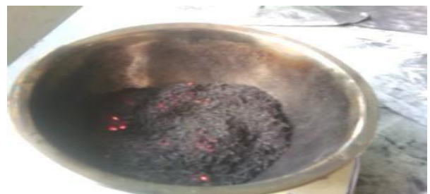
FIGURE 2: CARBON COIR FIBER

silicone rubber mould (SRM). Two types of sample were prepared one sample for Izod impact test and another sample for the creep test. The open mould type was used with rectangular shape according standard (ASTM D256) for Izod impact test and dumbbell-shape samples follow the standard ASTM D2099 for creep test. Total number of samples for