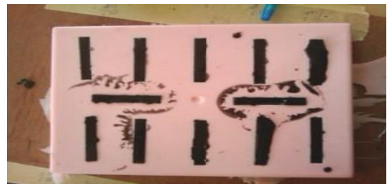
FIGURE 3(A): SRM OPEN MOULD FOR IZOD IMPACT TEST SAMPLE