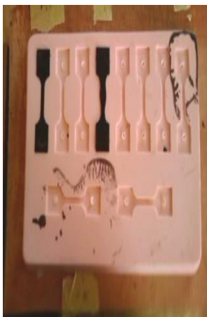
FIGURE 3(B): SRM OPEN MOULD FOR CREEP TEST SAMPLES MECHANICAL PROPERTIES USING IZOD IMPACT AND CREEP TEST

It was agreed with previous report stated that mechanical properties of the natural fibre composites depend on several factors such as the stress–strain behaviours of fibre and matrix phases, the phase volume fractions, the fibre concentration, the distribution and orientation of the fibre or fillers relative to one another [29]. The low impact strength of shorter fibres composites may also be due to the presence of too many fibre ends within the composites, which could induce crack initiation, hence increased potential of the composite failure.