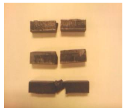
FIGURE 7: PHOTO OF SPECIMEN AFTER IZOD IMPACT TEST

The WOF of komeng coconut carbon fibre/epoxy resin composites based on the un-notched