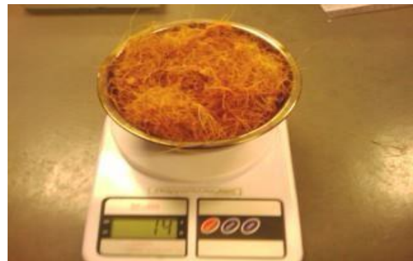
FIGURE 1: WOVEN OF KOMENG COCONUT

Belmeres et al. [22] found that sisal, henequen, and palm fibre have very similar physical, chemical, and tensile properties. Cazaurang et al. [23] carried out a systematic study on the properties of henequen fibre and pointed out that these fibres have mechanical properties that are suitable for reinforcing thermoplastic.