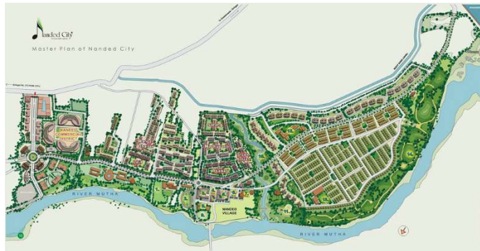
Fig 05. Map showing location of Magarpatta and Nanded City

Nanded City is a township located in the south-west of Pune, India. Construction began in 2010 and continues to develop itself with newer housing societies.