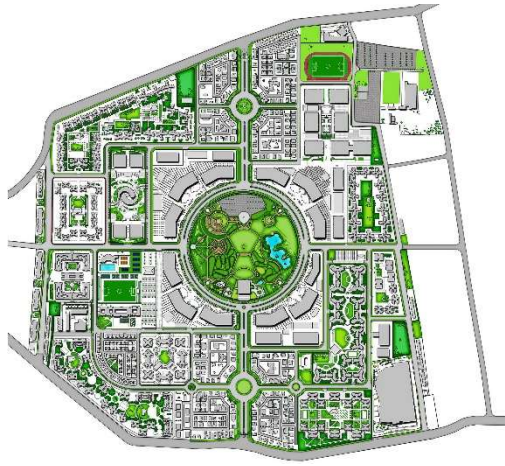
FIG: 02. Map of Magarpatta city (Source Internet)

Residents who were living there for 2 to 15 years fill in the questionnaire. According to responses of residents, All the recreational activities, celebration of festivals like Ganesh festival, Diwali Celebrations etc., Independence Day, Republic Day etc. are celebrated in Eco Garden or Aditi Garden and amphitheater which is present right besides Aditi Garden and maximum footfall in recreational areas is seen during evening (4 pm to 6pm).