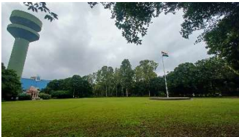
FIG: 03 Aditi Garden and Amphitheater

As per maximum residents community spaces are well maintained, and seating areas are in good condition. 80% of residents feel that the parking provided for community spaces is sufficient and 20% of people responded that parking is not sufficient as if there are visitors they are anyhow or is a pay and park system.