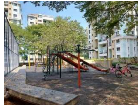
FIG: 04. Children play area in society of Magarpatta city and