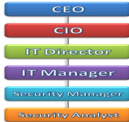
Figure 2 : An example hospital organizational structure.

Strong and efficacious network security begins with management support. The security manager oversees the security team and is responsible for ensuring resources are focused where necessary. This can be a balancing act between security responsibilities and normal IT responsibilities. The manager must also ensure that team members are consistently reviewing security data and reports so incidents are noticed and duly investigated. The security team must be supported further by an executive at the director or higher position (like Chief Information Security Officer). The director must handle funding for the security program. They must also understand IT security risk and be able to present this effectively to the rest of the organization. Most importantly, they must help the security team navigate the politics and culture of the entire hospital. Without support from the rest of the organization at a high level, the security team will be hindered during investigations and response, they will not be able to enforce policy, and they will not get proper funding. Management support is required to get the resources necessary, both in personnel and monetary, to efficiently and effectively deal with security problems. Their support is also needed for policy change and enforcement. "Those with the power to allocate resources, both financial and the time of employees, can control any change expressed from lower in the power structure.