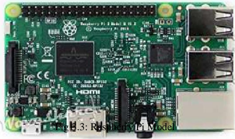
Fig 3.3: Raspberry Pi Model