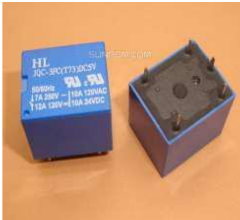
Fig 3.4: Relay

A relay is an electrically operated switch. Relays are used where it is necessary to control a circuit by a separate low-power signal. A relay with calibrated operating characteristics and sometimes multiple operating coils are used to protect electrical circuits from overload. As shown in above figure raspberry pi is connected to the devices via relay. Here relay can be operated as switch to on or off the devices.