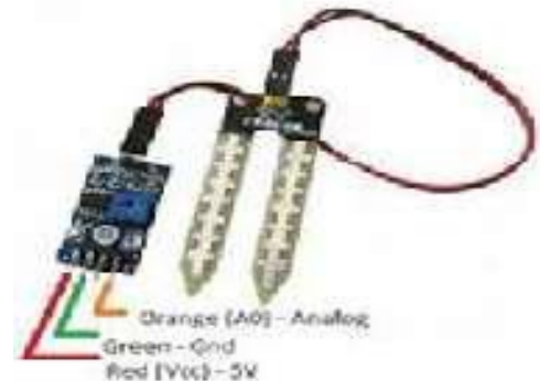
Fig 3.2.1: Soil Moisture Sensor