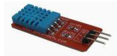
Fig 3.2.2: DHT 11(Temperature Sensor)