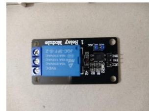
Fig 4: 2 Channel 5 volt Relay,

Relay module consist of VCC, Gnd, and control inputs. The relay module was powered by 5V DC. This module was used and attached to the microcontroller so that the electrical connections can be turned on or off by the user.