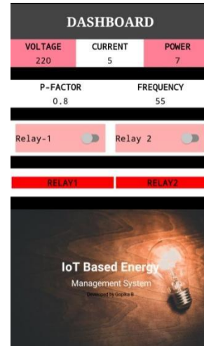
Fig 8: Mobile Application

Web development is done by python djanjo framework. MIT app inventor is a third party application which acts as user interface between mobile and control equipment. It is an open-source application building platform. Application behaviour will be provided by piecing blocks together in a visual blocks based programming language