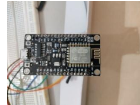
Fig 3: NodeMCU

Arduino doesn't have built-in support to wireless network. Therefore developers need to add a wifi module to the board and write code to access the wireless network. Node MCU is a microcontroller which has built-in support for wifi connectivity and hence makes IoT applications developments much easier. It is an open-source software and hardware development environment which is built-in an inexpensive chip ESP8266. It provides low-level control for the specific hardware. Node MCU can be programmed using Arduino IDE.