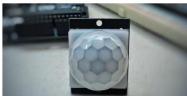
Fig 7: PIR sensor

PIR sensor helps user in sensing motion. This sensor is commonly used to detect whether a person moves in or out of the sensor range. PIR sensor is small in size, inexpensive and easy to use. It is able to detect different levels of infrared radiation. Once there is infrared radiation from the human body particle with temperature, focusing on the optical system causes the pyroelectric device to generate a sudden electrical signal.