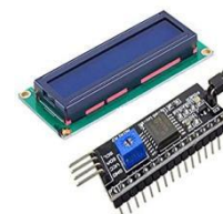
Fig 5: 16*2 LCD Display, (source: https://www.amazon.in/Easy-Electronics-16x2-Module-Arduino/dp/B07GC15X91 )

This is a 16*2 LCD display screen. It have i2c communication interface. It only needs 4 pins for the display; VCC, GND, SDA, SCL.