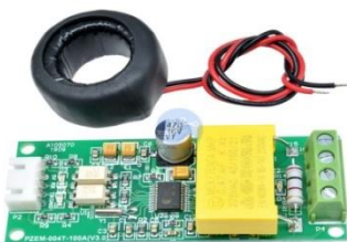
Fig 2: PZEM 004T, (source: PZEM-004T V3.0 User Manual)

PZEM 004T multifunction AC power monitor is a very popular smart meter used in electrical consumption measurement projects. It is great for measuring voltage, current, power, and energy. It comes with serial TTL interface. It has overload detection function. The main part of PZEM 004T module is of SD3004 chip.