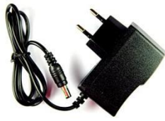
Fig 6: SMPS

SMPS stands for switch mode power supply. It is mainly used to achieve regulated DC output voltage from unregulated AC voltage. It provides supply from source to loads. It is very important for power consumption. They are efficient than liner regulators. Power loss will be much less than transformer based power supplies. In our project we had used 5Volt 1Ampere power supply.