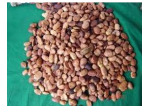
Fig 1: Pongamia seed

The seeds of Pongamia pinnata seeds were grinded into fine particles and Pongamia oil-bio-lubricant is extracted from it. The following figures represent the seeds used for grinding and the extracted Pongamia oil.