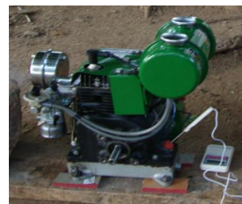
Fig 3: Single cylinder four stroke SI engine

The lubrication characteristics were performed using single cylinder four stroke SI engine using various blends of lubricants at different working environment like various temperature and speeds to determine the specific gravity, flash point, pour point and kinematic viscosity using specific gravity tester, open cup apparatus, pour point tester and red wood viscometer.