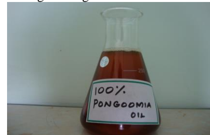
Fig 2: Pongamia oil