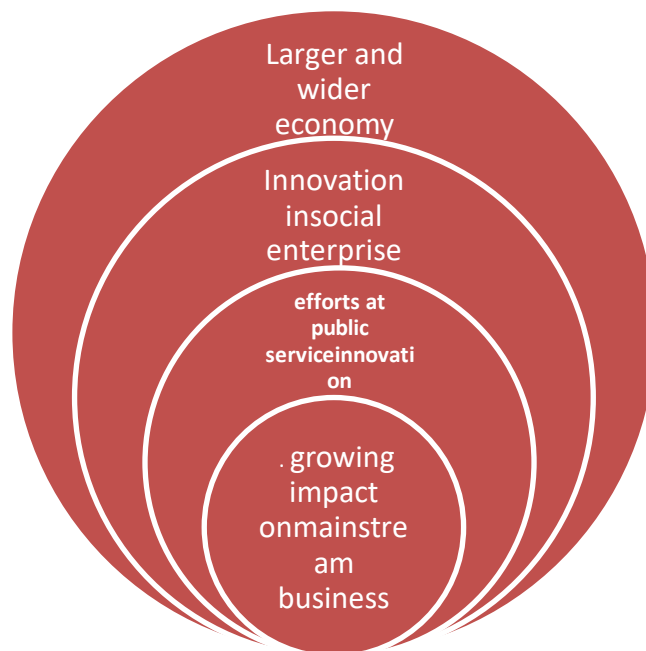
Fig _1 The social innovation system