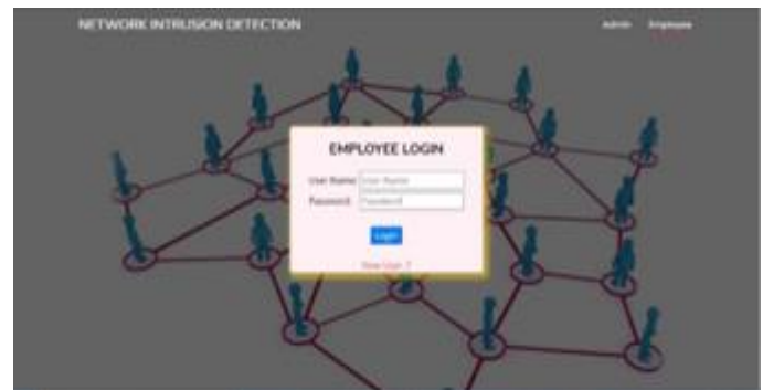
Figure 3: Employee registration window

Employee module: Using employee module as shown in figure 2 user who is working in company can register with application and login to application and view profile as shown in figure 3. Employee who wants to check status or want to know if there is any anomaly in network connection or packets which are sent by him or any other employee inside company can request admin to check from the data set and update to employee. Employee can view anomaly packets inside the network after responding from admin.