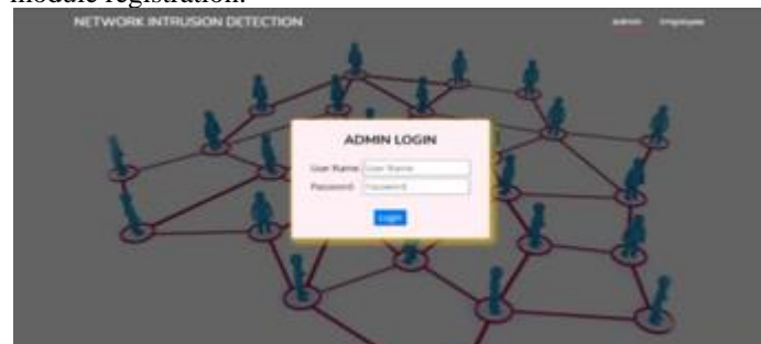
Figure 4: Admin details

Admin module: Admin a module who looks after network related issues inside a company who will login with application, they can log dataset of networking packets which are part of the company and whenever they get requests to check anomaly identification request admin will upload data set, pre-process data into test and train and then create model and predict from the test data and predicted result is displayed to admin and sent requested user. Figure 4 shows the admin module registration.