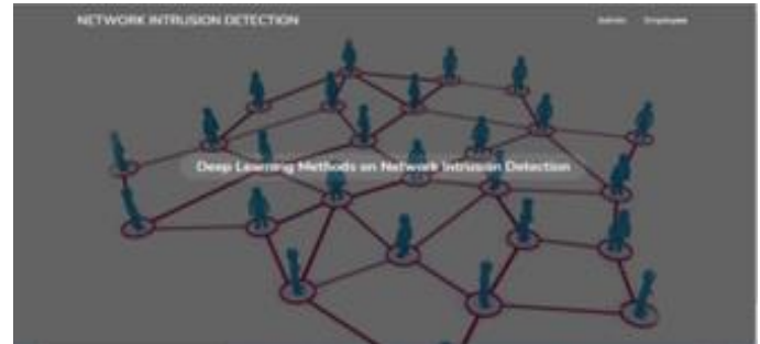
Figure 2: View of Employee module

Employee module: Using employee module as shown in figure 2 user who is working in company can register with application and login to application and view profile as shown in figure 3. Employee who wants to check status or want to know if there is any anomaly in network connection or packets which are sent by him or any other employee inside company can request admin to check from the data set and update to employee. Employee can view anomaly packets inside the network after responding from admin.