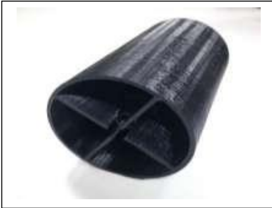
Fig.3 3D printed Prototype Capsule

This is analogous to the Syringe Effect, technically known as the Kantrowitz Effect. This is highly problematic, as it forces to either go slowly or have a super huge diameter tube. Interestingly, the solution to this seemingly grave problem can be overcome by a simple solution. By creating vents in the bottom side of the capsule and employing a compressor fan, the air pressure in front of the capsule can be relieved. The compressor fan aids the movement of the capsule by guiding the air flow through the vents at high pressure. When high pressure air is pumped between two surfaces, an air bearing is formed which offers zero friction to the movement of the surface. The concept of air bearings can be understood through the air hockey table. The compressor fan is run by the supplied provided through batteries installed inside the capsule