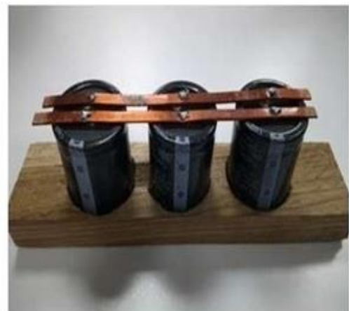
Fig. 7 Capacitor Bank

A variable number of turns per slot will allow the inverter to operate at a nearly constant phase voltage, and it will simplify the power electronics design. Accelerators at each terminal will have two inverters – one for accelerating outgoing capsules and the other to capture energy from incoming capsules when they slow down, allowing for regenerative braking.