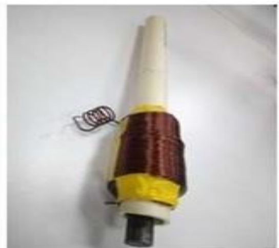
Fig. 6 Prototype Coil Gun

loop pod. This force given by the projectile is enough to launch the pod thus satisfying the function of coil gun as a propulsion device. However implementing a coil gun on a large scale is not practical as well as feasible. The coil gun generates massive amounts of magnetism. For safe operation, a majority of the costs would be required to provide magnetic shields. A safer and more feasible option would be to opt for a Linear Induction Motor.[4] The stators will be laid along sections of the tube will be long enough so that it can accelerate and decelerate the capsule between the speed of 480 and 1,220 km/h and to accelerate at 1g. They would be installed near stations and at booster points along the line. There is approx 1% length of tube would need to be fitted with stators. The three-phase stators, will be laid out on either side of the rotor symmetrically, there will be one slot per pole per phase.