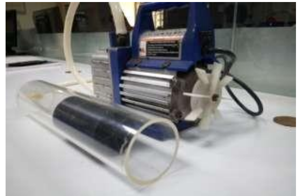
Fig. 2 Capsule Schematic

The Capsule or the Pod is the actual component of the Hyperloop responsible for transportation. It is a passenger/goods carrier that traverses within the evacuated tube at high speeds.