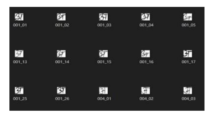
Fig. 3. Devanagari Vowels Dataset (NHCD)

cropped to show character boundaries. Figure 3 shows what the dataset looks like. [3]