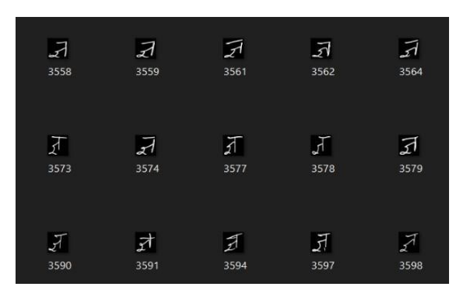
Fig. 1. Devanagari Consonant Dataset (DHCD)