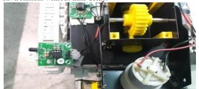
Fig.3 Snapshot of the System

To illustrate the behavior of the MBGV system and in order to confirm the findings of the previous section, the bilateral controller was designed. The set of hardware designed of Figure 3 shows the gripper in contact with the environment without time delay.