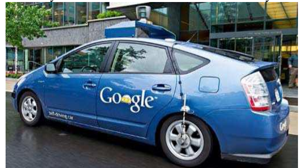
Figure 1: Google Driverless Car