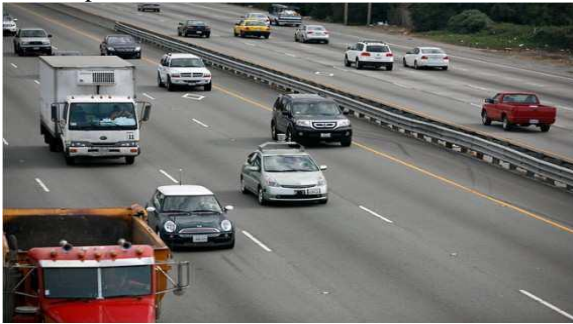
Figure 4: Going Driverless on road

Autonomous cars will be able to “talk” to each other and navigate safely by knowing where they are, by using RADAR, CAMERAS, GPS, SENSORS and Wireless Technology in relation to other vehicles and by means with connectivity they can communicate with obstacle like traffic signals. As a result traffic flow becomes smoother; an end to traffic jams and greater safety would be achieved by illuminating the frustration and dangerous driving that’s often triggered by sitting in heavy congestion for ages. When it comes to sustainability, the self- driving car also holds great promise by figuring out the most –direct, least traffic jammed route by driving without quickly accelerating or breaking too hard, all which leads to saving on fuel consumption.