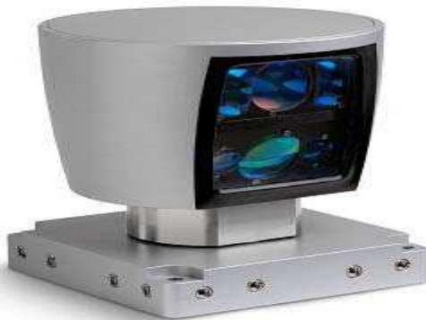
Figure 2: HDL 64E Lidar

autonomous ground vehicles and marine vessels, a sensor named HDL- 64E LIDAR is designed for obstacle detection and navigation. Its scanning distance is of 60 meters (~ 197 feet). For 3D mobile data collection and mapping application this sensor becomes ideal for most demanding perceptions due to its durability, very high data rates and 360 degree field of view. One piece design patented the HDL- 64E's uses 64 mounted lasers that are fixed and each of it is mounted to a specific vertical angle mechanically with the entire spinning unit, to measure the environment surroundings. Reliability field of view and point cloud density is dramatically increased by using this approach.)High resolution maps of the world are combined by the car laser measurement to produce different types of data models that allows it to drive itself, avoiding obstacles and respecting traffic laws. A LIDAR instrument consists of a Laser, Scanner and a specialized GPS receiver, principally.