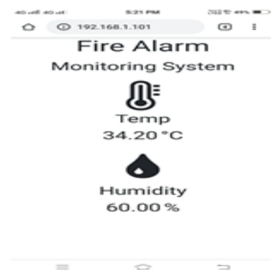
Fig1. Basic layout of web page

Intelligent fire detect and alarm control system is of fire signal detected, transmitted, processed and controlled system. And smoke fog, temperature, and flame of fire detect and alarm system is proposed based on IOT. Fire is very dangerous situation and it's very much necessary to monitor and give warning before anything unwanted happens. In many developing countries, houses do not come fitted with fire alarm system. This results in fire being attended and leading to lot of loss of property, human and so also in developing countries like India we do not have strict laws pertaining to installation of Fire Alarm system. So there is an urgent need towards developing an automated fire monitoring and warning system.