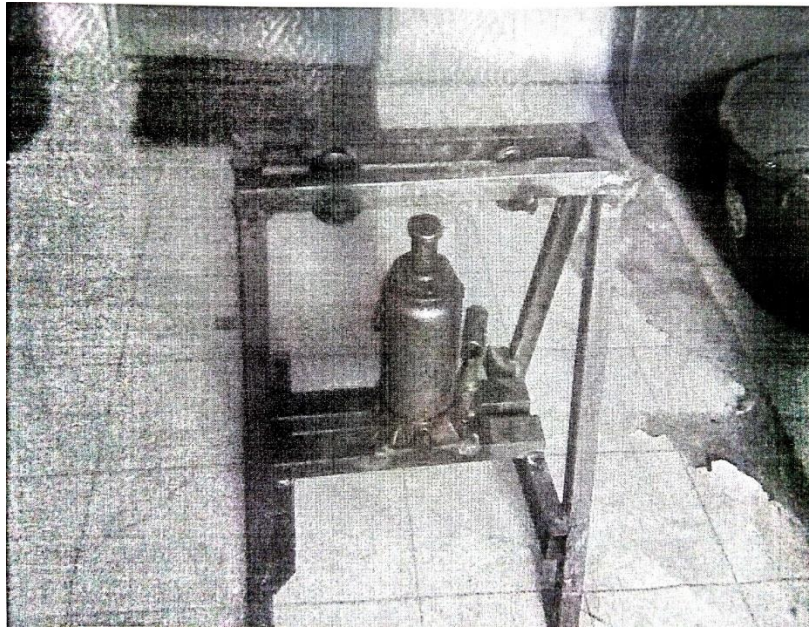
Figure 2. assembly of machine