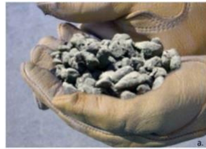
Fig 3.3 (a) little water

While any consumable water can be used for mixing, the proportion of water is fundamental for the improvement of the voids in pervious concrete. Water-to-cement extents can run from 0.27 to 0.30 with extents as high as 0.40. Wary control of water is fundamental.