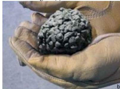
Fig 3.3 (b). Correct amount of water