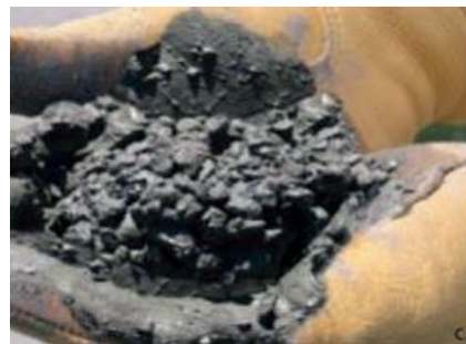
Figure 3.3. (c) Much water.