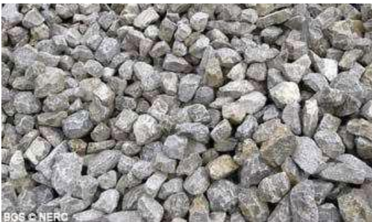
Figure 3.2: Coarse Aggregates

Coarse Aggregates is the section of the strong which is included the greater stones embedded in the mix. Concrete contains three fixings; Water, cement, and aggregate. particle shape and size, surface, and digestion. The standard kind total for use in pervious cement is commonly squashed stone or waterway rock. Run of the mill sizes are from 10mm t 25mm.