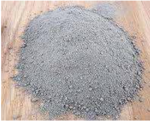
Figure 3.1: Ordinary Portland cement