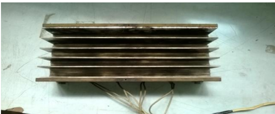
Fig.1. Assembly of the fin array