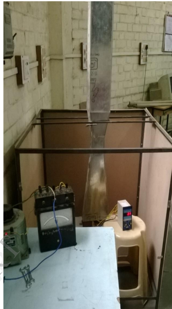
Fig. 3. Fin array assembly is mounted inside the cavity of syporex block and chimney for forced convection