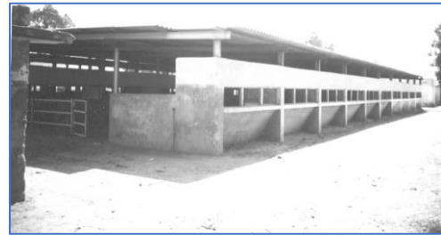
Diagram (1): Semi-open barn Diagram (2): Front Layout of the semi-open barn (1) Asbestos roof. (2) Ventilation opening. (3) A short wall. (4) Concrete floor.