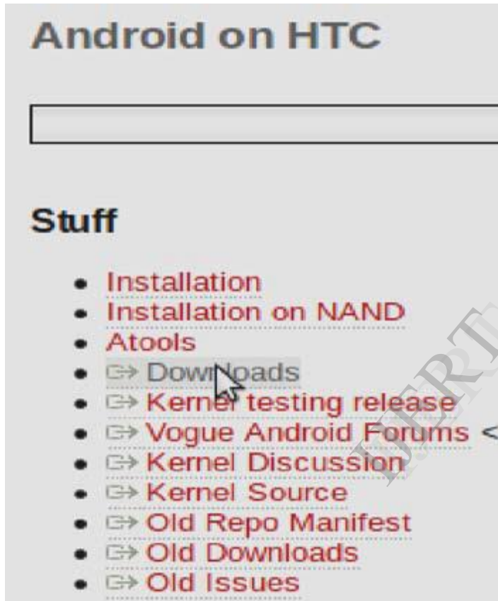
Fig. 3: Download Content Android to Smartphone

The second step for downloading the operating system is being governed by the all basic phenomena which are main and necessary content for this proposed system.