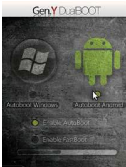
Fig. 9: View on Mobile for Dual Booting For Android and Windows