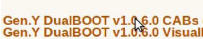
Fig. 7: Download Content of Gen.Y DualBOOT for Smartphone

Go the Gen.y DualBOOT.Cab and download it into user cell phone root Directory which the previously mentioned that is Andboot Folder.