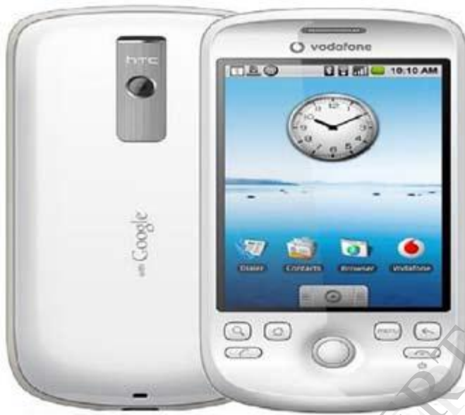
Fig. 1: A Sample Smart Phone

As per proposal requires some basic technique on the basis of that it would be made so much easier to implement this proposal in a practical way. There has some kind of algorithm according to which the overall performance of the smart phone will increase its composition and destroy the virtual phenomena that cell phones can't be dual boot. The best way by which the overall technique will govern is being following: