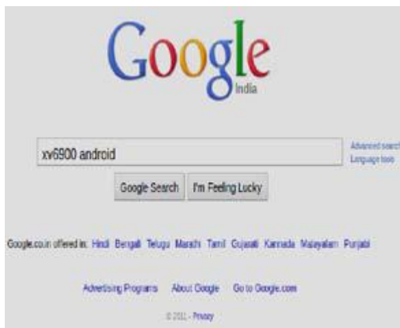
Fig. 2: Google Search Compatibility for Android to Smartphone

To find the smart phone is compatible with android operating systems is or not just go with Google, it means