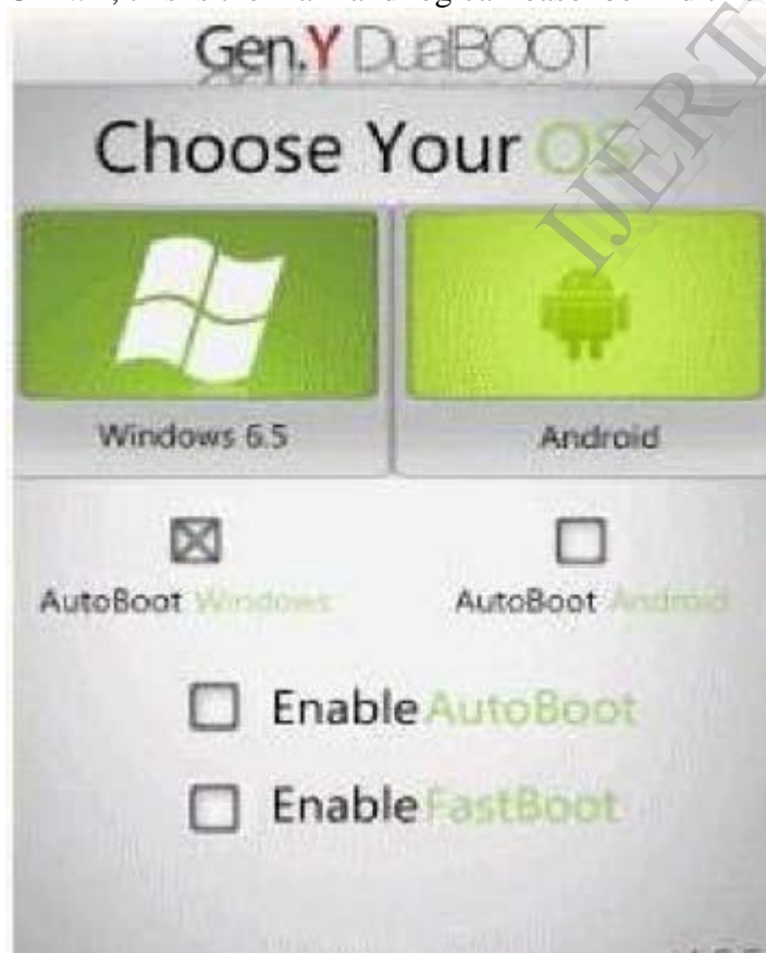
Fig 6: Clip of Dual OS in Smartphone After Installing Gen.yDualboot

The main advantage of dual booting is that it is one of the main best features which make a cell phone as like a system by which user makes it very simple and attractive look and by doing this phenomenon the phone gets its best feature to make dual booting. This feature is called GEN.Y, this is the main and logical reason behind this to make it dual bootable.