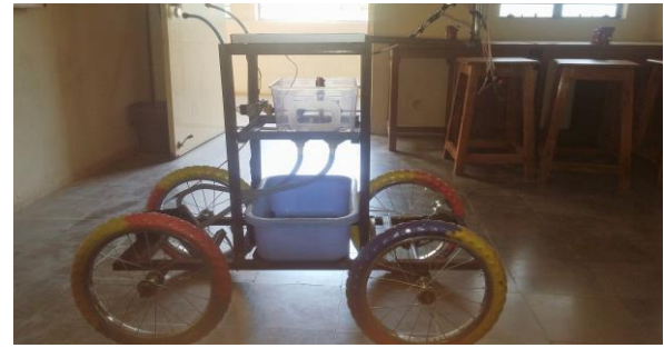
Figure 2: Prototype model of multipurpose agricultural vehicle