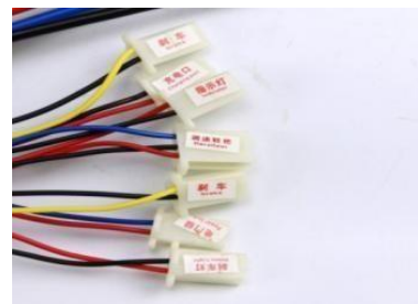
Fig.3 Functions of Pins