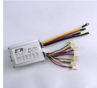
Fig.2 Controller Device

The mechanism of an electric speed controller differs depending on whether you own an adaptive or purpose-build electric bike. An adaptive bike includes an electric drive system installed on an normal bicycle. A purpose-built bike, more expensive than an adaptive bike, provides easier acceleration and affords extra features.