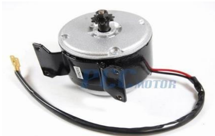
Fig.1 Working of Electric DC Motor.

Working Principle: - A motor is an electrical machine which translates electrical energy into mechanical energy. The principle of working of a DC motor is that "whenever a current carrying conductor is placed in a magnetic field, it practices a mechanical force".