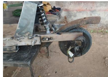
Wheel and suspension assembly