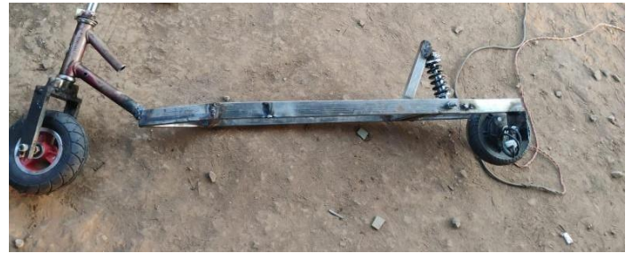
Base frame structure

The images are attached which depicts the assembly of scooter: