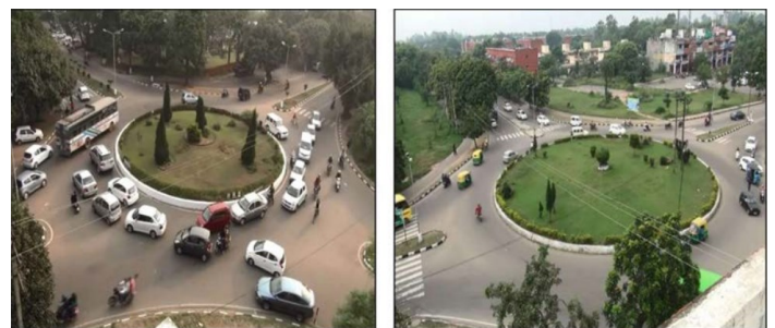
Fig. 1, Traffic and operational conditions of roundabouts in India [13]

The demand of roundabouts is increasing day by day as it has many benefits. As a part of National Cooperative Highway Research, it is found that the crashes caused by roundabouts are reduced by 75 percent and fatalities by 90 percent compared to normal traditional intersections. One of the main reasons behind this is the traditional four-legged signalized intersection has 32 conflict points, and at the same time a single lane roundabout has only 8. Since the roundabouts are continuously moving and yield controlled, it is possible to handle huge traffic and it can reduce congestion on approaching roads. It has less maintenance cost as it requires only electricity for streetlights at night and for nearby landscaping. Even though it has a lot of advantages over other kinds of intersections, the condition and efficient working of roundabouts in India are poor. This might be due to the design guidelines followed by the practitioners. Certain parameters were not taken into account for the design, since a pure conventional method is followed. Now, there are a lot of innovative approaches emerging to design roundabouts more efficiently which includes simulation using software's, optimization techniques, and more practical guidelines and so on. Therefore, this study is intended to do a comprehensive study on the analysis and design of roundabouts by reviewing literatures and other resources. The traffic and operational conditions of roundabouts in India is given Figure 1 [13].