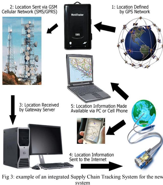
Fig 3: example of an integrated Supply Chain Tracking System for the new system

GSM: an integrated communication device to send and receive data via a cellular network.