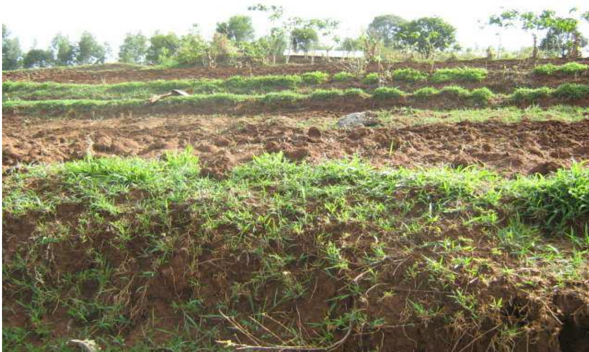
Fig 3. Elephant grass planted on newly constructed soil conservation structure.