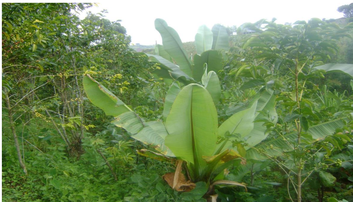
Fig 1. Perennial crops completely covered the soil at the homestead of Garud farm.