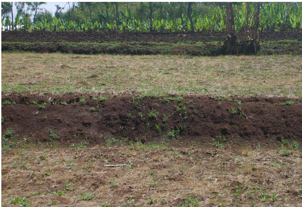
Fig 4. Well conserved farm in Bhakhunkhola area.