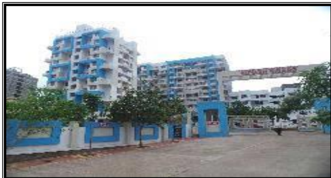
Fig. 5 Site: SuyashNisarg Project area: 3 acres

In order to study the economical aspect of crush sand as a viable alternative a case study was undertaken to investigate the cost saving aspect of M –sand.