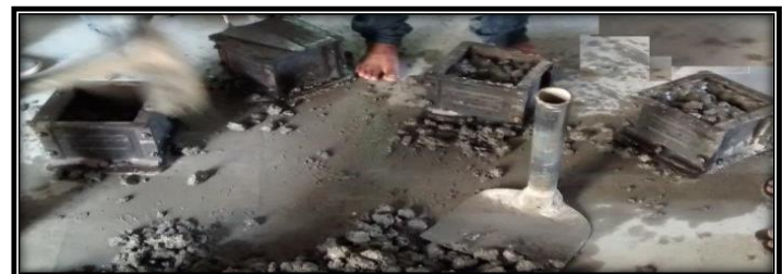
Fig. 4: Casting of moulds