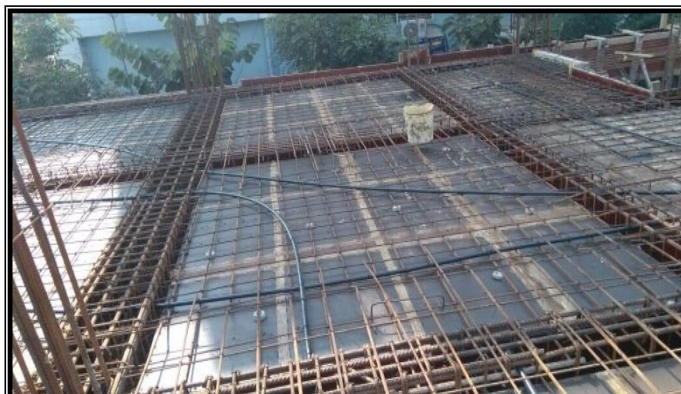
Fig.6 Pictures of concreting on site