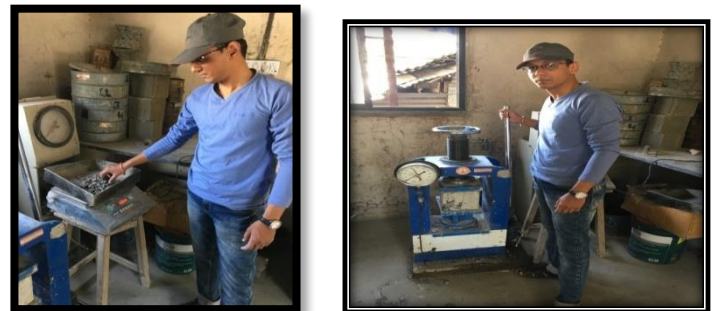
Fig. 3 :Pictures of project

Thus the target compressive strength can be achieved by complete replacement of river sand by stone quarry dust in concrete and enhanced workability be maintained by mixing suitable admixtures like fly ash and certain chemicals in concrete.