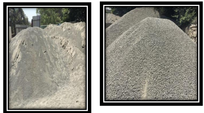
Fig. no. 1 C rushed sand on site