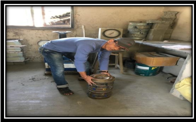
Fig. no. 2 Sieve analysis by sieve shaker