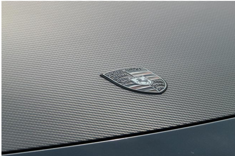
Figure 2: a high-aspect-ratio carbon-fiber fabric as an analog for CNT alignment