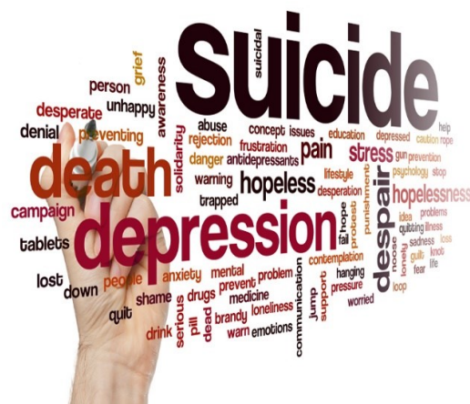
Fig.3.words that show high risk suicidal texts.