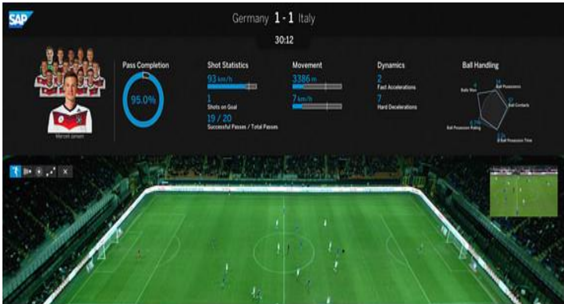
Figure 2: Match Insights Application use