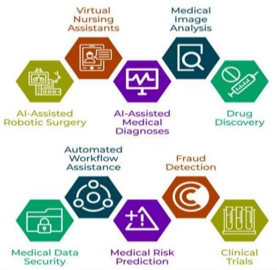
Figure 2: AI Assistance in Health Care Sector

This is the year 2022 covid vaccine is found, but the complete cure is not found. During the covid outbreak the nation was in chaos and to control it frontline workers put their lives on the line and saved us[7]. They guided people through a hard time. So, to be prepared for further situations like this we must not put our guard down and continue to practice proper immaculateness, but we know that this is not a 100% effective solution[8]..