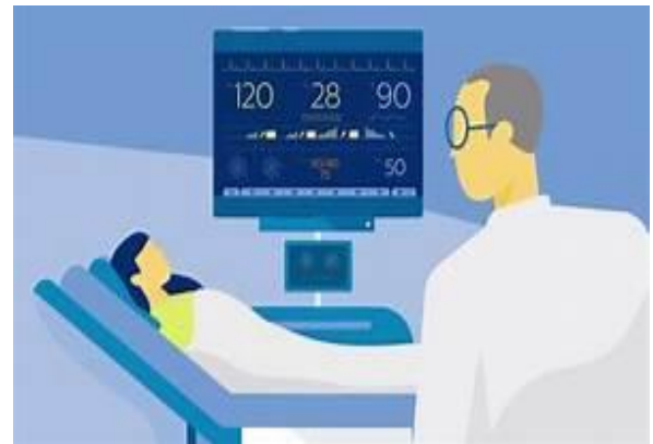
Figure 4 : Virtual assistance for patient health

These days we have many health assistance apps provided on the internet, there we provide the symptoms of our constrained health and the system runs for the references for the given symptoms and give out a probable report for what medical assistance is required[9]. With data collection at the suffering person’s level, with the aid of data collection these AI tools assist in recognition of the kind and size of a suffering person’s state, bestow wellbeing adjuration of the suffering person. Figure 4 shows the usage of AI tools in health care.