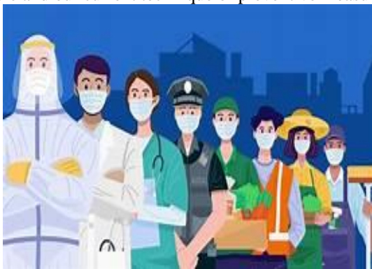
Figure 3 : Assistance for front-line workers

There is a proverb which states that “ Prevention is better than cure ” and hence we need to upgrade our lifestyle and our current technique of preventive measures.