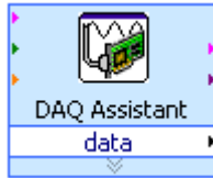
FIGURE 2 DAQ Assistant

Suppose, if the temperature is greater than set point then it turns on relay system by providing zero volts to it or no supply to it through program. The write to measurement file Express VI involves in providing a spreadsheet that shows the temperature with respect to time in excel sheet. This allows monitoring more easy and efficient.